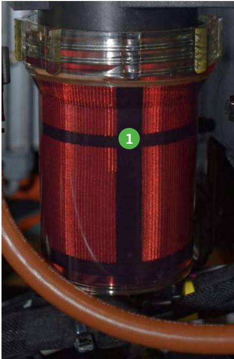
1 NEW: Enhanced Fuel Filtration that supports common-rail fuel injection.