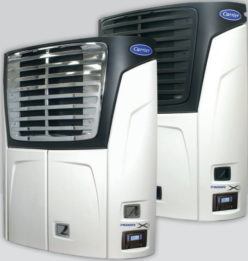
The 7500R unit shown with chrome grille/stainless latch option.